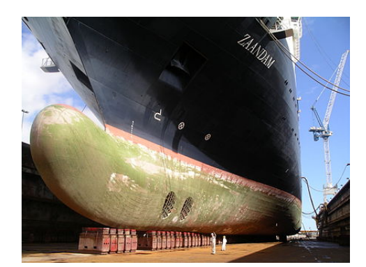
A "ram" bulbous bow curves upwards from the bottom, and has a "knuckle" if the top is higher than the juncture with the hull—the through-tunnels in the side are bow thrusters.<sup>[1]</sup>

Vessels with high kinetic energy, which is proportional to mass and the square of the velocity, benefit from having a bulbous bow that is designed for their operating speed; this includes vessels with high mass (e.g. supertankers) or a high service speed (e.g. passenger ships, and cargo ships).<sup>[3]</sup> Vessels of lower mass (less than 4,000 dwt) and those that operate at slower speeds (less than 12 kts) have a reduced benefit from bulbous bows, because